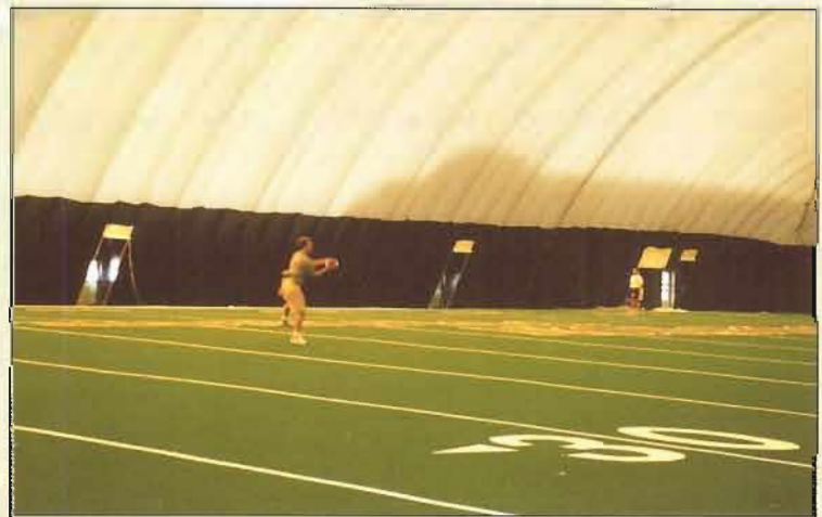
Boston College - Interior