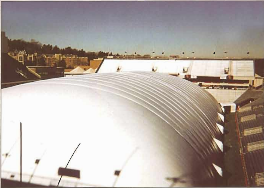
Boston College - Exterior

Yeadon® is the industry leader in air-supported football structures and has numerous structures worldwide that allow year round football play.