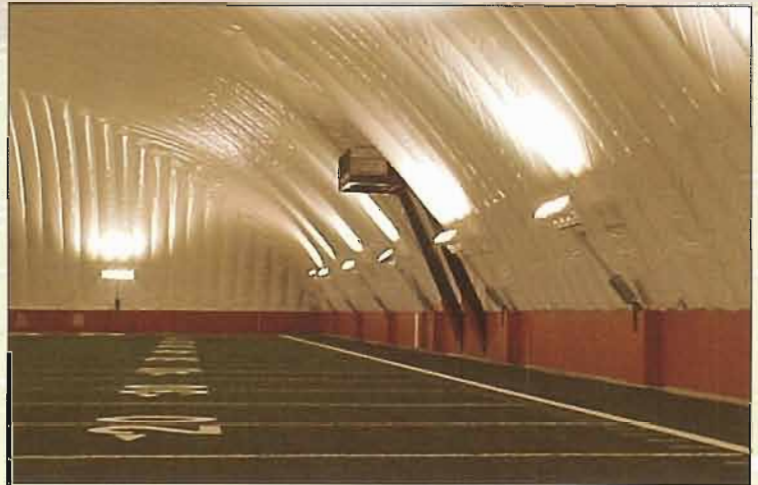
University of Texas - Interior