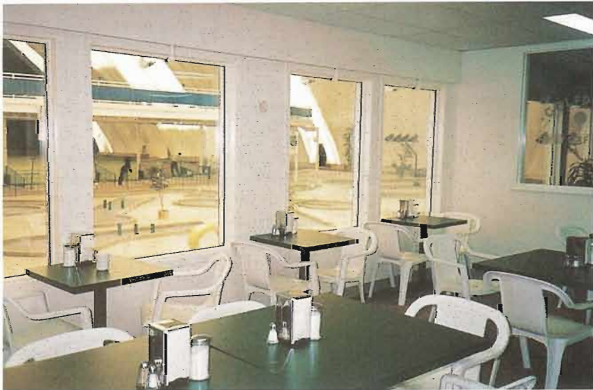
Restaurant / Lounge