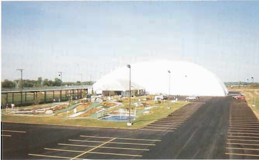
Golden Bear Golf Center 280' x 300' x 80' high – 58 Tees Syracuse, NY