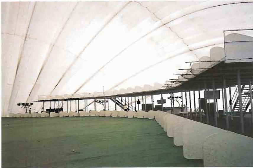
Two-level Golf Driving Platform