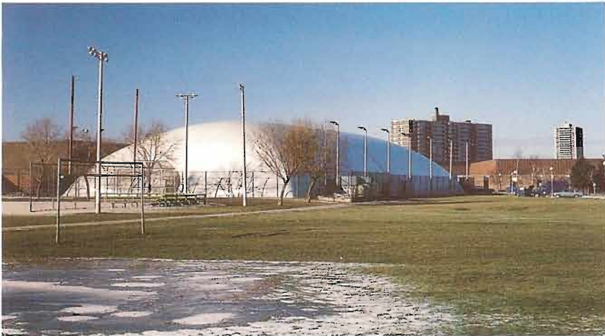
North York Winter Tennis Club 4 Court tennis – membrane and mechanical unit replacement North York, Ontario