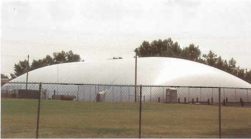
Rico Tennis Academy 4 Court tennis – membrane replacement Calgary, Alberta