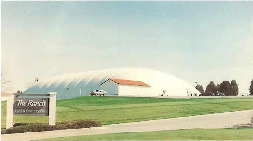
The Ranch Country Club 4 Court tennis – TEDLAR membrane replacement Westminster, CO