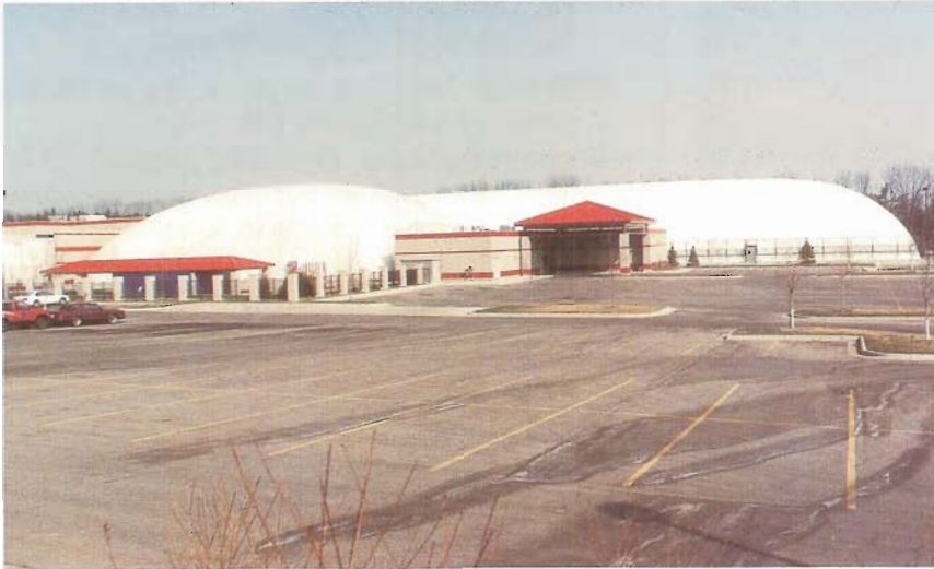
Michigan Athletic Club, Lansing, MI Pool Dome 110' x 154' x 41'h with 6 Court Tennis Dome