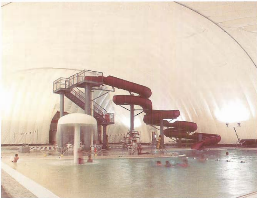
Michigan Athletic Club, Lansing, MI Showing 25 ft. high slide