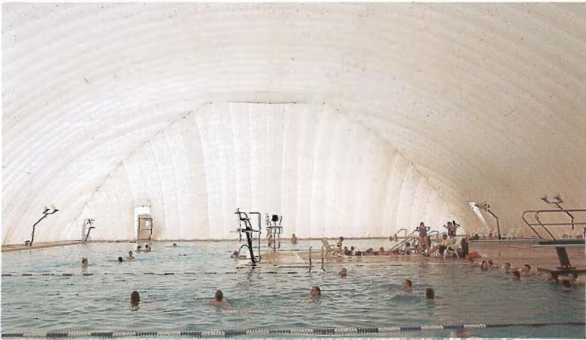
American Fork Fitness Centre American Fork City, UT Approximately 128' x 193' x 37'h