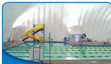
Old Dominion Aquatic Club