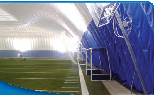
University of Toronto Toronto, Ont., 455'L x 210'W x 61'H

Yeadon ® is the industry leader in air-supported structures ideal for sports and recreation, military and industrial usage. Yeadon ® has numerous structures worldwide and can be utilized in virtually any climate.